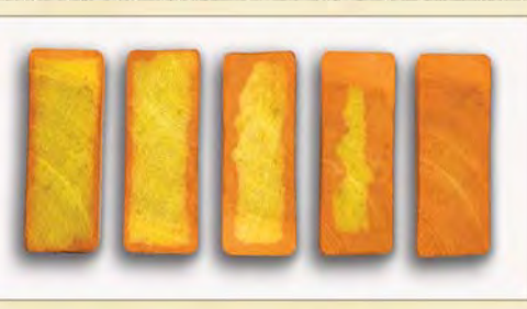
An added colorant demonstrates Bora-Care's penetration into wood.

borate mineral salt that is deadly to insects. And because it is a mineral salt, it will not break down over time. When Bora-Care is sprayed on the wood, its patented formula penetrates into the wood and remains there, providing years of long-term residual protection.