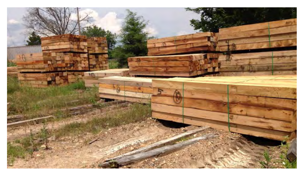
FIGURE 3. Dead stacking nonseasoned ties prevents drying and will quickly lead to decay and/or insect damage. Soil contact during storage or drying is also to be avoided.

Many insects and fungi exist that feed on, or nest within, freshly harvested logs or sawn material. Thus, green (nonseasoned), unprotected wood such as a freshly cut crosstie is a preferred material. Furthermore, these organisms