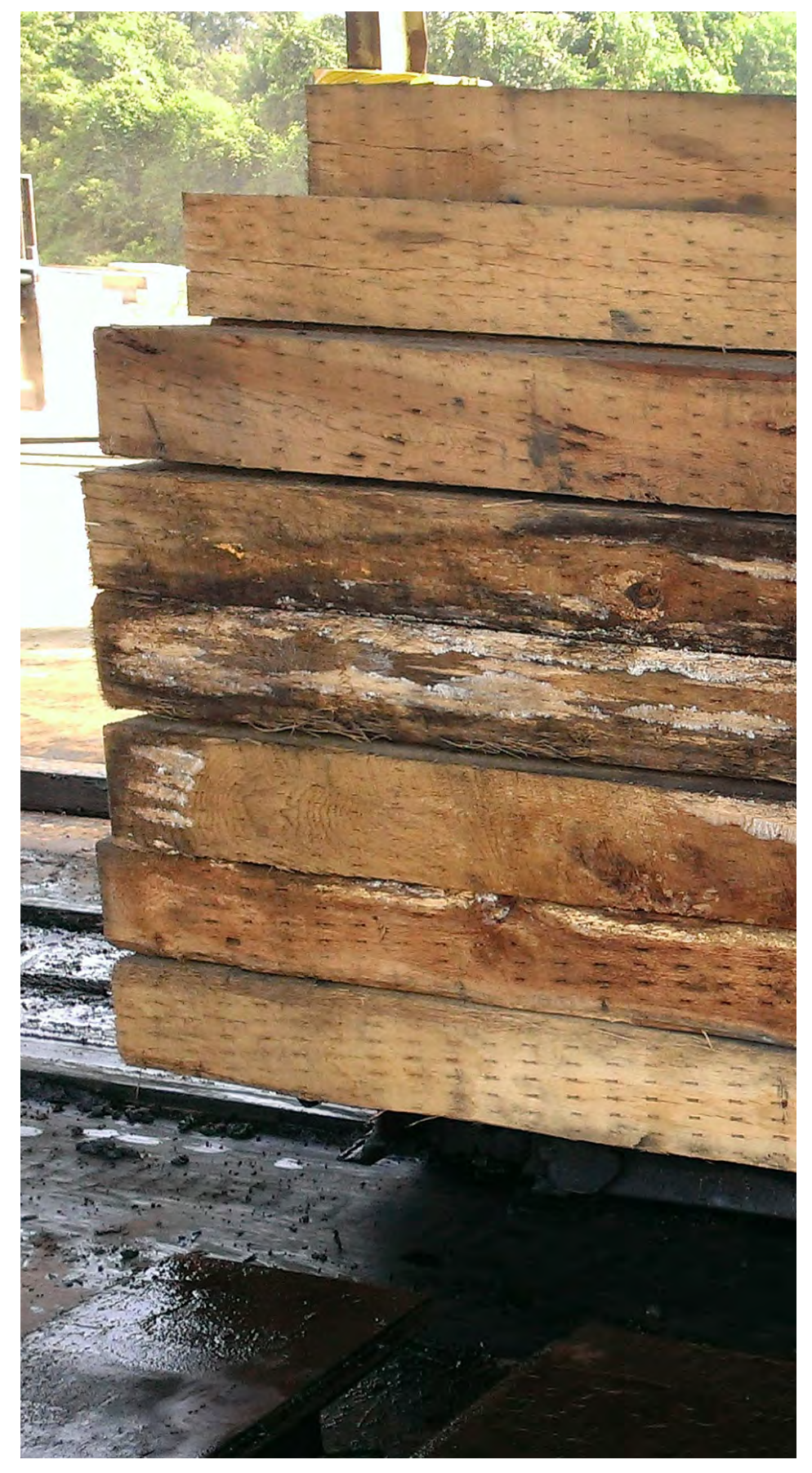
FIGURE 8. Stack burned (partially rotten) ties going into the treatment cylinder. These ties have lost some of their potential for excellent service and this loss cannot be recovered.

Under proper drying conditions (German stacked or stickered), normal drying times for the Southeast are five months for mixed hardwoods and nine to 10 months for oaks and hickories. The time periods are shorter in the Southwest. But note that "air dried" ties are considered dry at 40-50 percent moisture content. At these levels of moisture content, ties are still in an ideal condition for internal decay; therefore, final creosote or copper naphthenate treatment should not be delayed (i.e., do not "overdry" the ties).