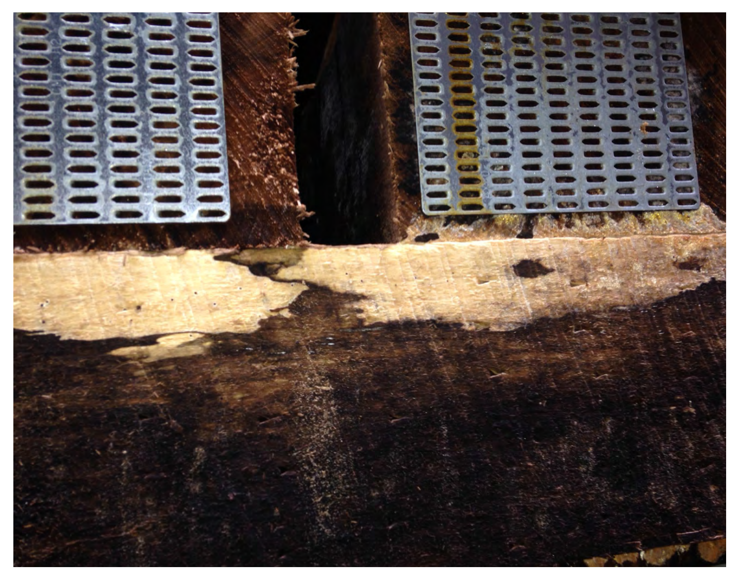
FIGURE 7. The white areas are rotten. This "stack burn" is occurring at the touch points between ties, where drying is retarded.

the wood. Such rot greatly weakens the wood locally, even when only a small percentage of the wood's mass in that region has been consumed by the fungi. Even with rapid processing from sawing to treatment, some stack burn will occur, but research suggests that if everything is done correctly, the strength of the tie as a whole is robust. However, the longer the time between sawing and preservative treatment, the greater the risk for stack burn that eventually will ruin the tie.