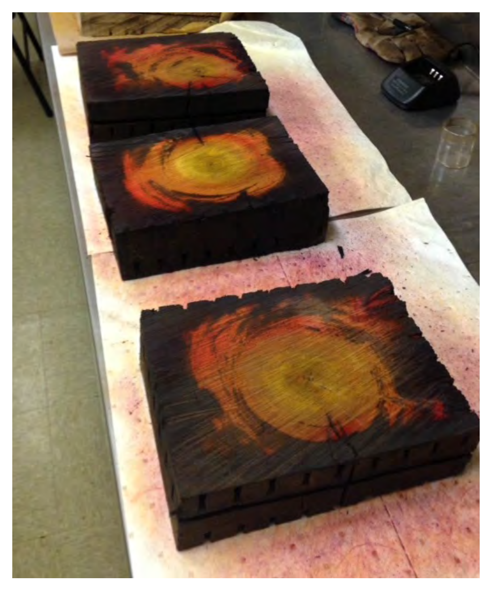
FIGURE 14. A dual-treated (two step) tie. The inner portion not penetrated by the creosote treatment is protected by the borate (curcumin sprayed to show boron as red).