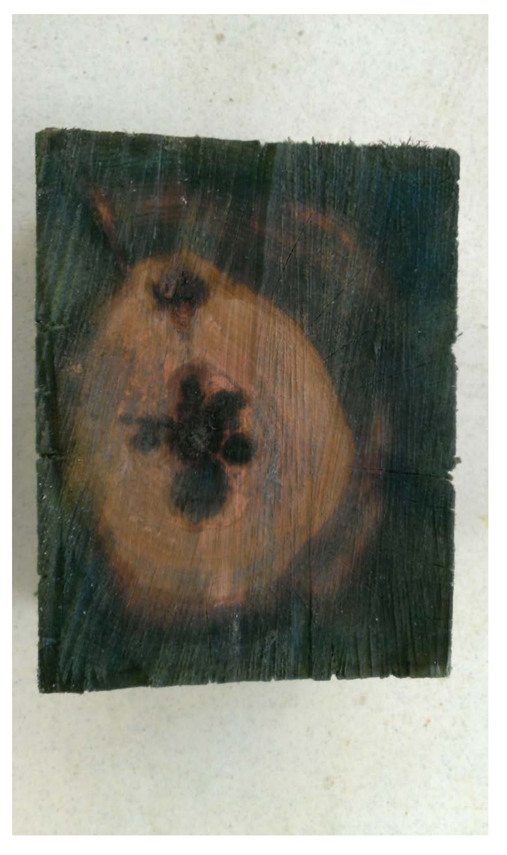
FIGURE 13. The heartwood of this tie was not penetrated by the copper naphthenate pressure treatment. Unless a diffusible preservative (e.g., borate) is used, the heartwood will not be fully protected in service.

Tests of dual treatment ties (using a two-step process) have demonstrated greatly extended service life. Because borate is inexpensive and has other benefits, dual treatments have become popular. The application of borate to the nonseasoned ties can help prevent stack burn and insect infestation during the drying process. If the ties are not chemically protected during drying, ensuring rapid drying and avoiding close stacking at sawmills or in gondolas for extended periods is even more important.