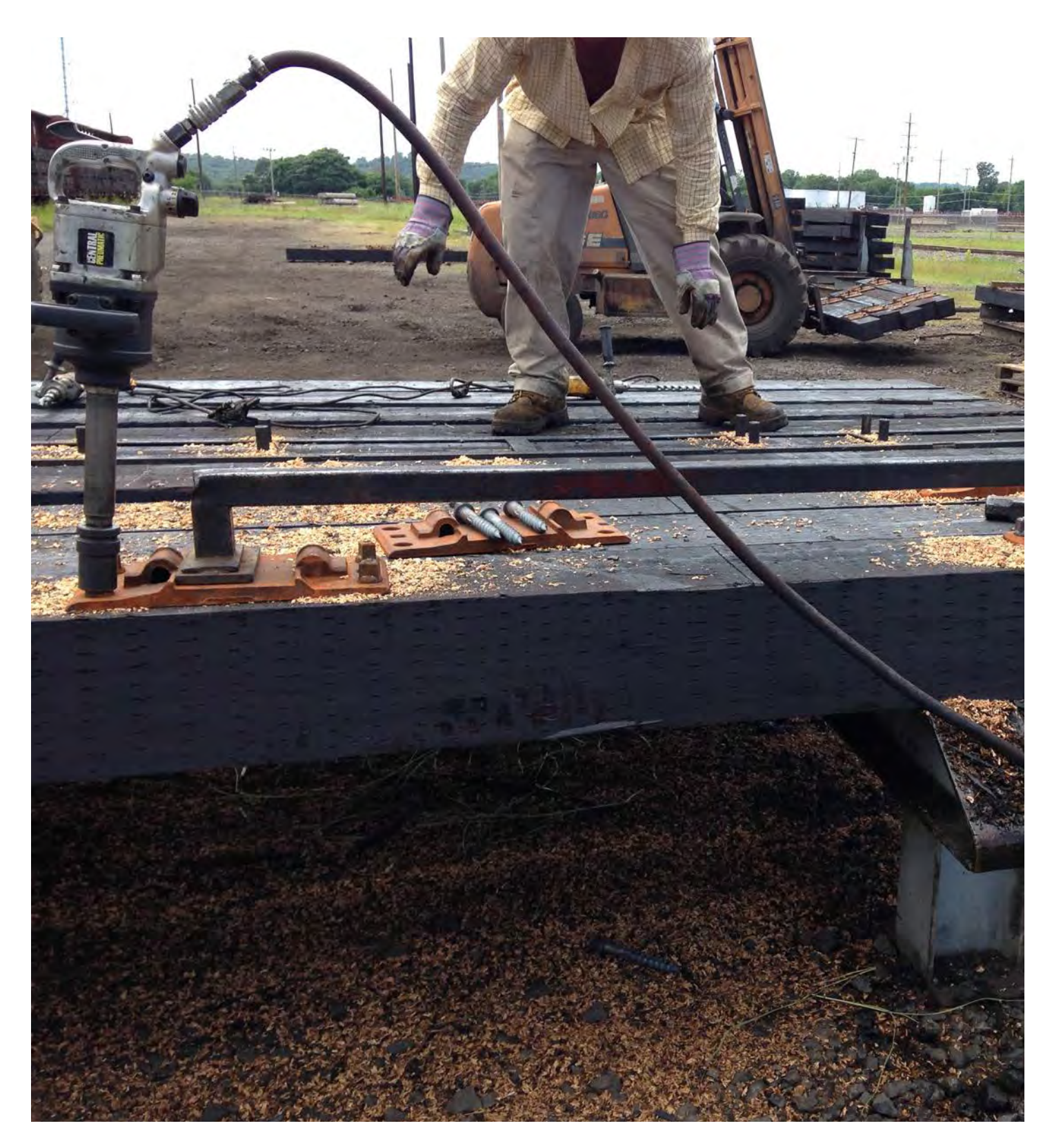
FIGURE 10. Drilling holes in a treated tie can expose untreated wood. Whenever possible, holes, daps, etc., should be cut before pressure treatment. If drilling or fabricating must be done after treatment, preservative must be applied locally at that time. Such "field" treatments are required under AWPA Standard M4, and copper naphthenate at 2 percent Cu is standardized for ground contact applications.