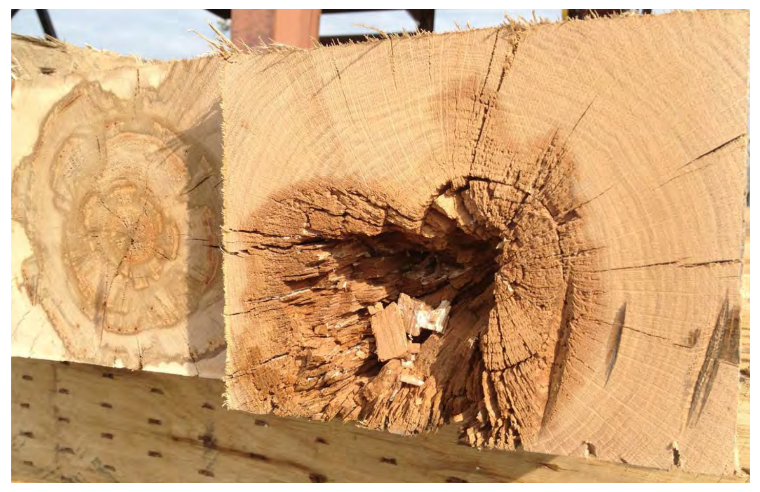
FIGURE 1. The rot in this freshly cut tie occurred in the living tree. It should be culled.

This guide explains the causes of tie degradation during manufacture and presents options that will reduce these risks. Some of the suggestions given here may already be standard practice in some organizations. Others may appear to be unnecessary or impractical. However, an installed railway tie represents a significant monetary investment. We suggest that proper handling procedures will ensure that the ties perform to their best potential, resulting in very significant long-term savings.