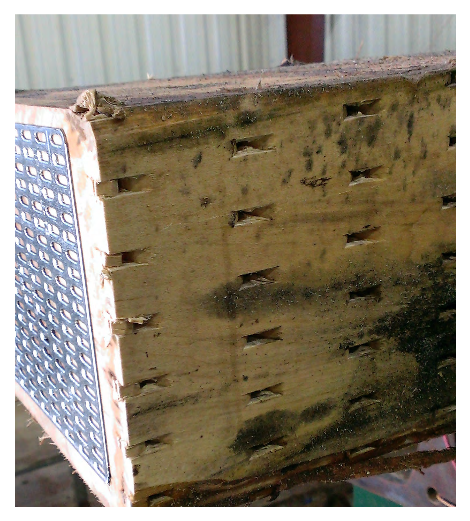
FIGURE 12. The incising of this tie will help penetration during pressure treatment. The end plate will reduce the severity of end splits.