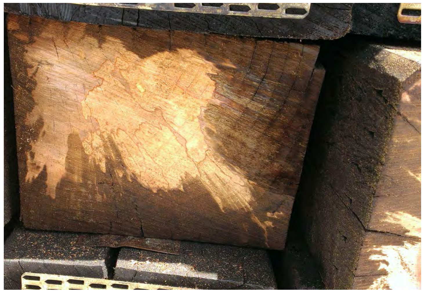
FIGURE 9. Stack burn weakens wood and can also interfere with treatment. Fungal activity can increase moisture content locally. Creosote failed to penetrate the areas where the fungus was established in this tie. The untreated areas are prone to decay in service.

<sup>1</sup>Gauge retention estimates the average amount of preservative in each tie by measuring the amount of preservative taken up by the whole load of ties. Treating "to refusal" means applying the pressure cycle for long enough that the ties will not accept any more preservative.