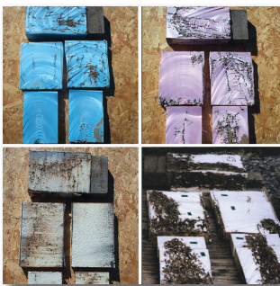
Termite-Damaged Untreated Foams