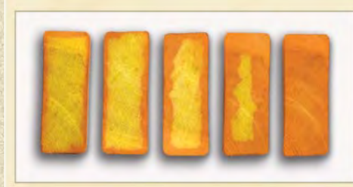
An added colorant demonstrates Bora-Care's penetration into wood.

Disodium Octaborate Tetrahydrate, a borate mineral salt that is deadly to insects. And because it is a mineral salt, it will not break down over time. When Bora-Care is sprayed on the wood, its patented formula penetrates into the wood and remains there for years, providing residual protection.