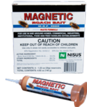
Magnetic Roach Bait®